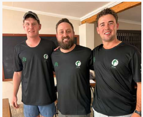
CBCOB members modelling the newly launched squash kit.